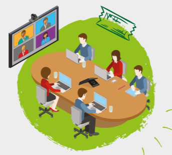
Mid-sized conference rooms